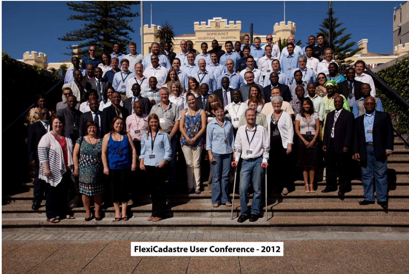
FlexiCadastre User Conference - 2012